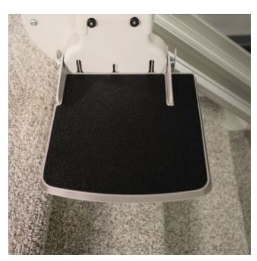
Not all options are shown.