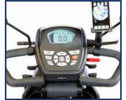
Control panel with LCD screen, cell phone holder, and Bluetooth sound bar