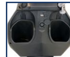
Two cup holders, charger port, and USB port