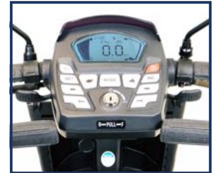
Control panel with LCD screen