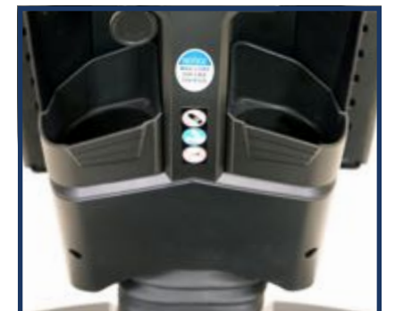
Two cup holders