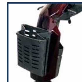
Foldable removable basket