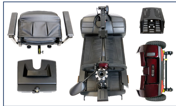
Disassembled for transport