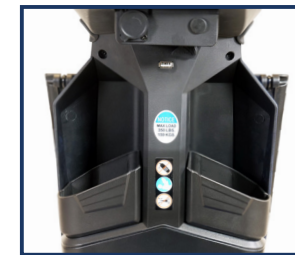
Two cup holders