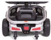
SATIN SILVER Limited Edition