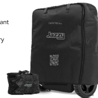
Jazzy ® travel kit shown