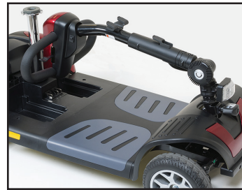
Step 3: Fold down tiller and lock in place!