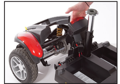
Step 4: Pull forward on the drivetrain release lever to separate the front and rear frame sections!