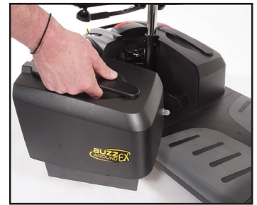
Step 2: Pull out the battery pack!