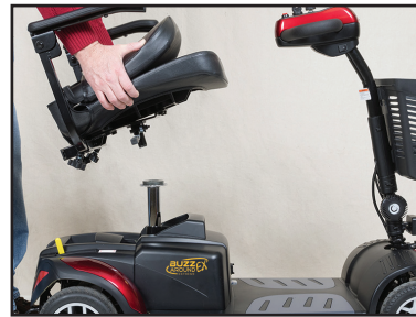
Step 1: Pop off the seat!