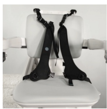
Not all options are shown.