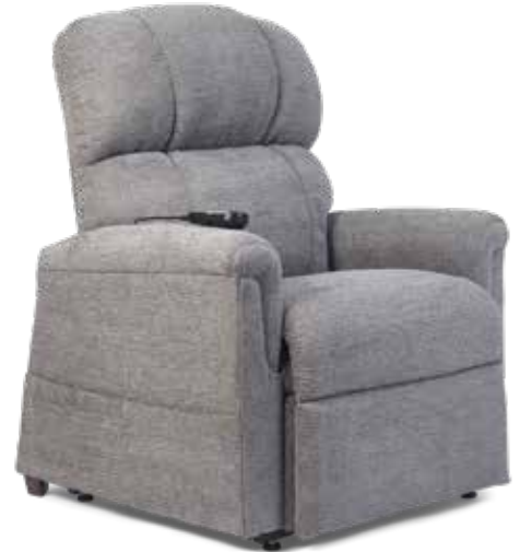
Shown in Anchor

Upgrade with Deluxe Therapeutic Heat & Massage!