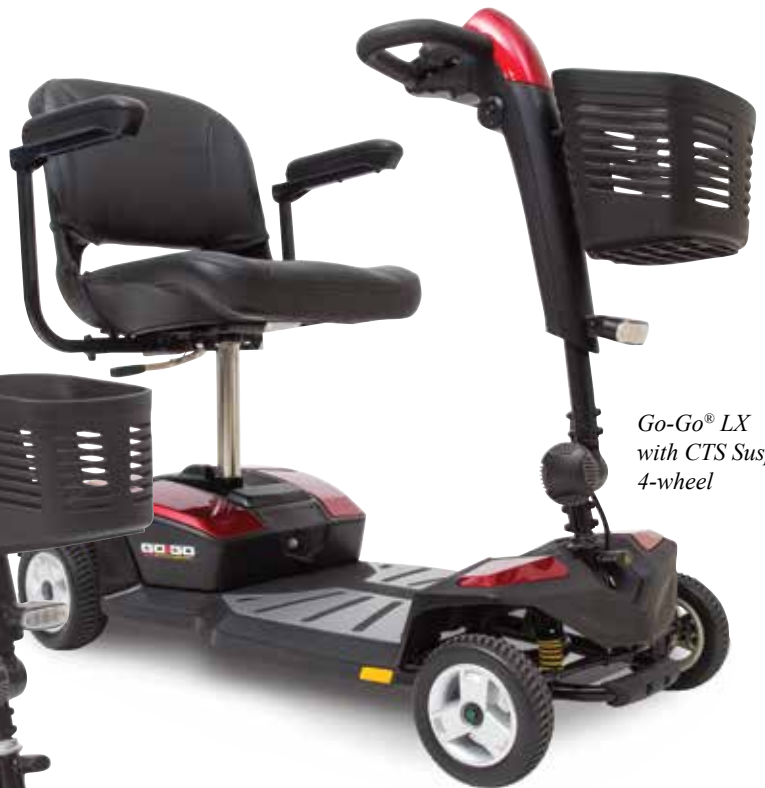
Go-Go ® LX with CTS Suspension 4-wheel