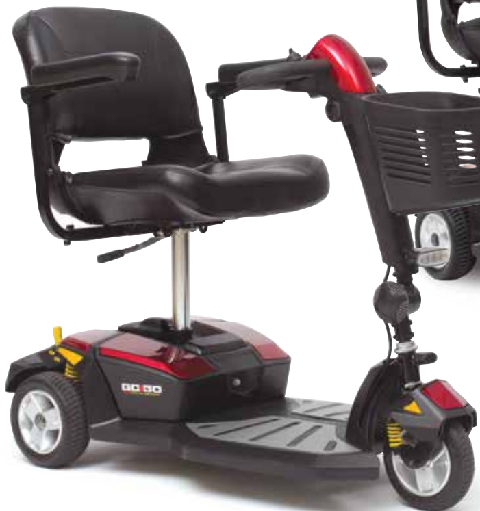
Go-Go ® LX with CTS Suspension 3-wheel

5711- Calgary Trail NW Edmonton AB T6H 2K1 P: 780-437-3300 F: 780-430-9381 www.medmobility.ca