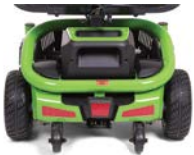
ENVY GREEN Limited Edition