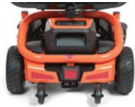
SOLAR FLARE ORANGE Limited Edition