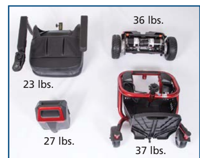
Perfect for transport!

Some accessories require a mounting bracket or mounting clips.