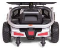
SATIN SILVER Limited Edition