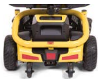
SUNBURST YELLOW Limited Edition