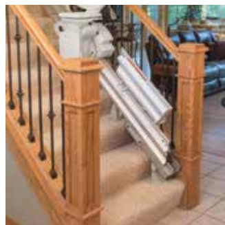
Power or manual folding rails for narrow hallway or when doorway is at the bottom of stairs.