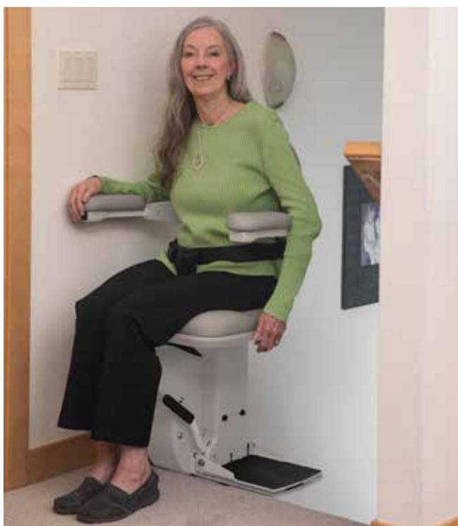
Offset swivel seat makes it easy to get on/off.