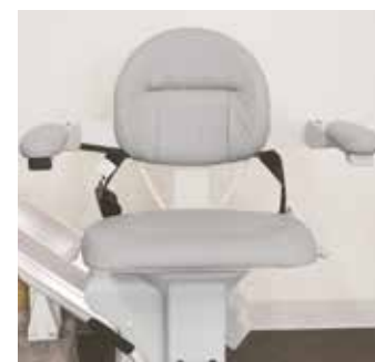
Larger seat and/or footrest for increased comfort.