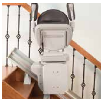
Power folding footrest automatically flips up/down when seat is raised/lowered.