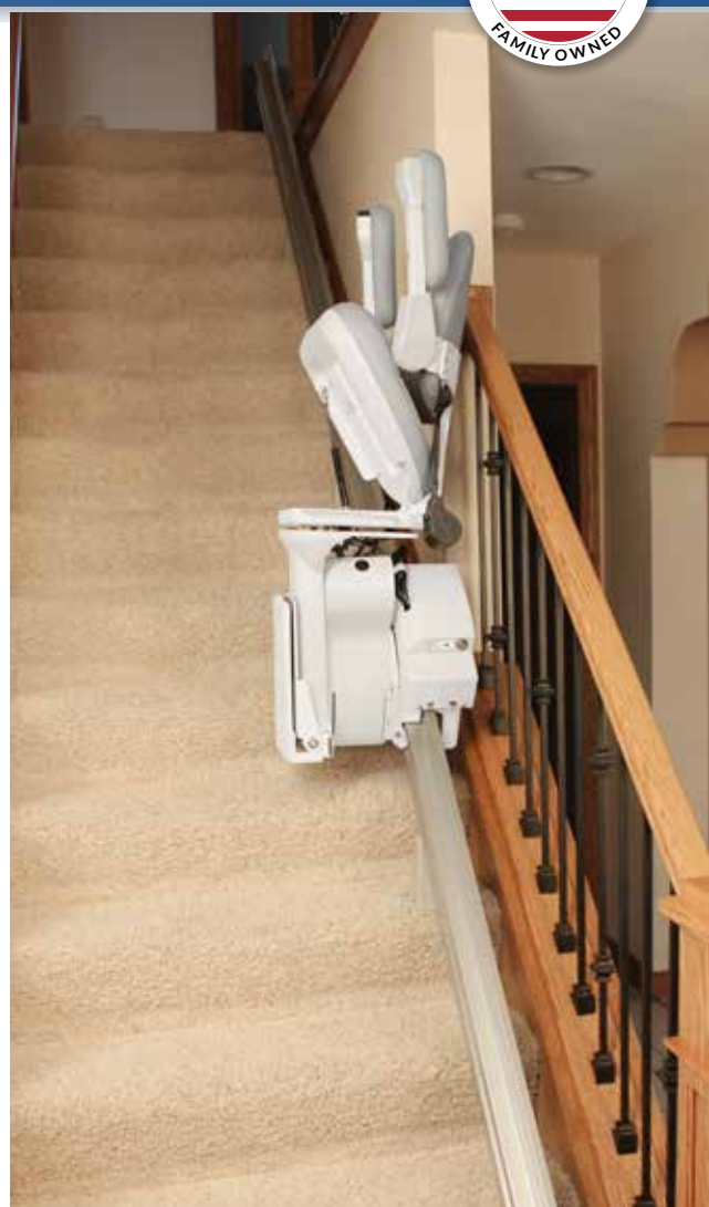
Compact design for open space on stairs.