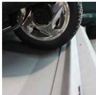
Wheel chock kit required for FWD powerchairs.