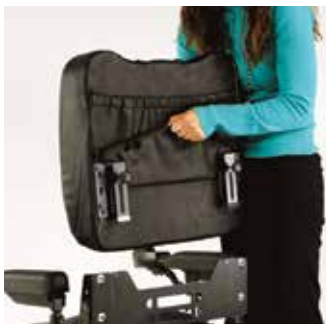
Back-Off easily removes back of mobility device to fit into shorter vehicle openings.