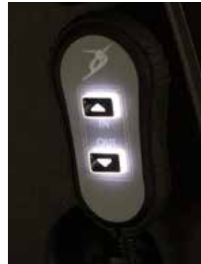
One button control with indicator light.