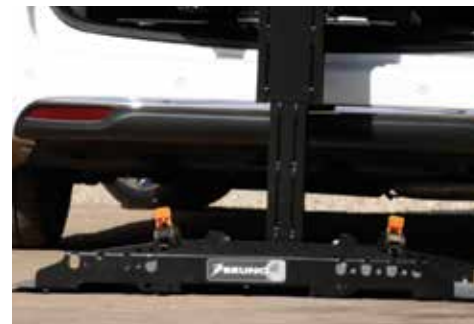
Belt kit* includes two retractable securement straps for added peace of mind. *Required in some vehicles