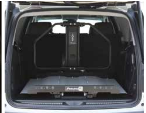
Industry-exclusive safety barrier. Protected by US Utility Patent No. 403.615