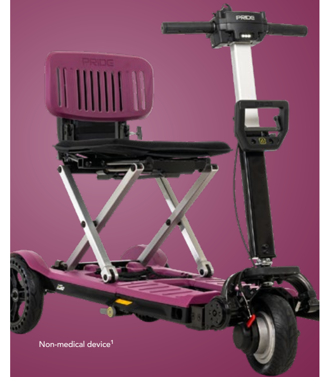
Non-medical device 1