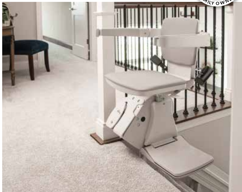
Offset swivel seat makes getting on/off easy.