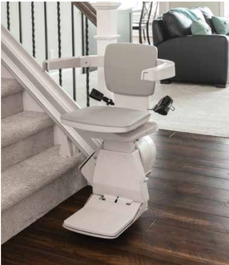
Padded, generous-size seat.