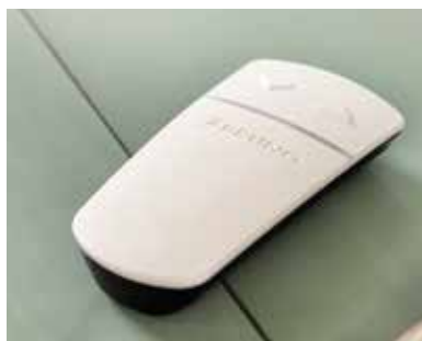
Two wireless call/sends allow remote control access.