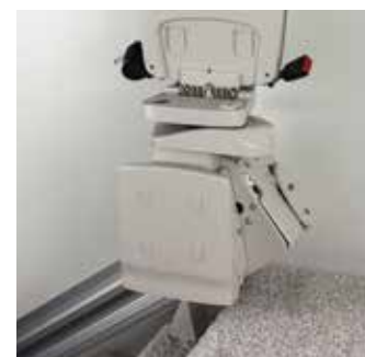
Power folding footrest automatically flips up/down when seat is raised/lowered. Arm switch control optional.