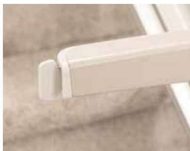
Ergonomic armrest control.