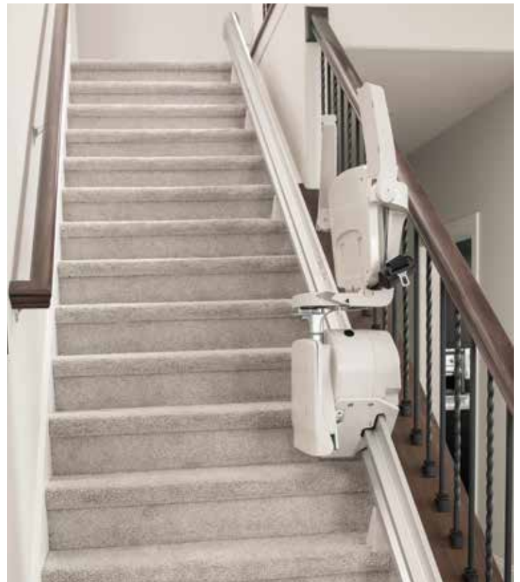
Compact design for open space on stairs.