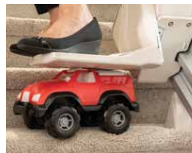
Sensors ensure safety.