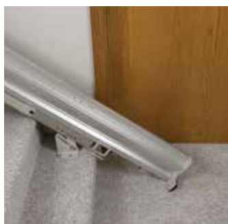
Manual or power folding rail for narrow hallway or when doorway is at the bottom of stairs. Manual operation or push button automatic.