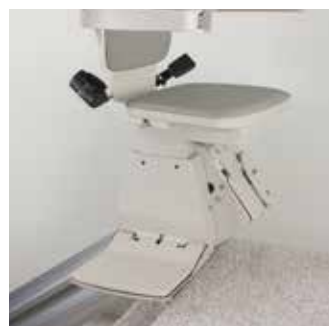
Power swivel seat for effortless exit. Armrest switch control or wireless call/send.