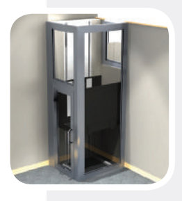
* Shaft supplied by others