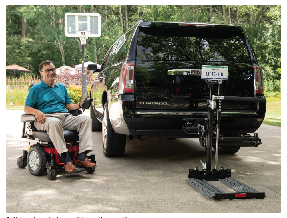
Self-leveling platform with traction coating.