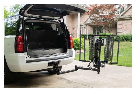
Swing-Away: Easy access to hatch/cargo space.