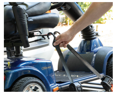
Securement device specialized to type of mobility device.