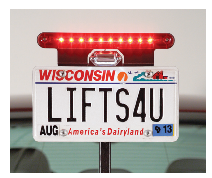
Low-profile third brake light.

Not Shown: •Vinyl cover •Center Platform Deck •Large Platform