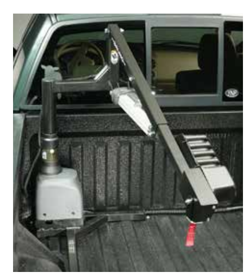
Variety of versions for different cab models.