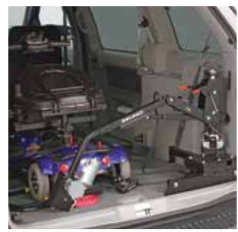
Lifter folds down when not in use.