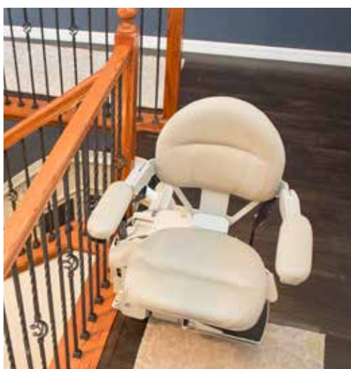
Offset swivel seat makes it easy to get on/off.