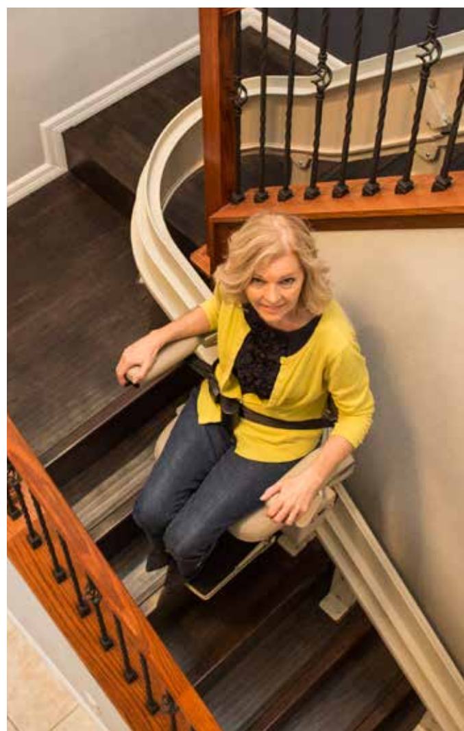
Crafted for a precision fit around curves.