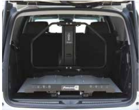
Industry-exclusive safety barrier. Protected by US Utility Patent No. 403.615