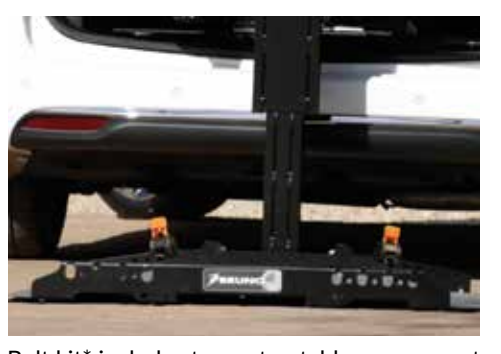
Belt kit* includes two retractable securement straps for added peace of mind. *Required in some vehicles