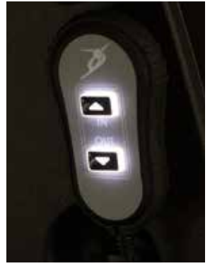
One button control with indicator light.