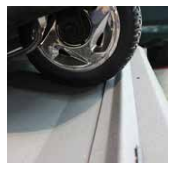
Wheel chock kit required for FWD powerchairs.