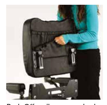
Back-Off easily removes back of mobility device to fit into shorter vehicle openings.