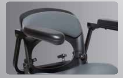
Optional (non-standard) armrests available for increased comfort