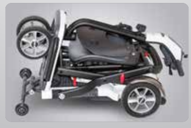
Unique folding design for fast, convenient storage or transport.