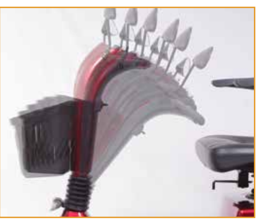
Patented infinite adjustable tiller