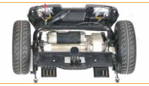
Quiet & maintenance free motor