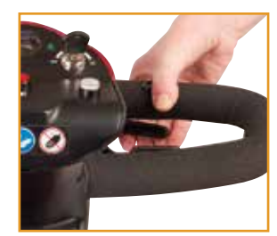
EZ Reach tiller adjustment