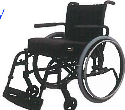
Quickie QXi, Ultra Lightweight Adjustable Folding Wheelchair