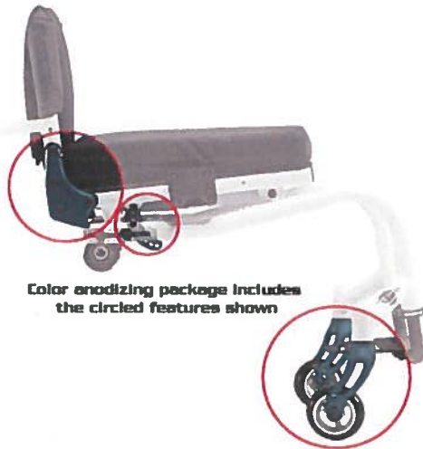
Color anodizing package includes the circled features shown