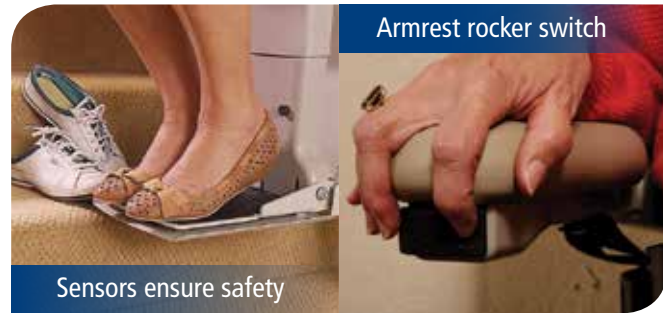
Armrest rocker switch