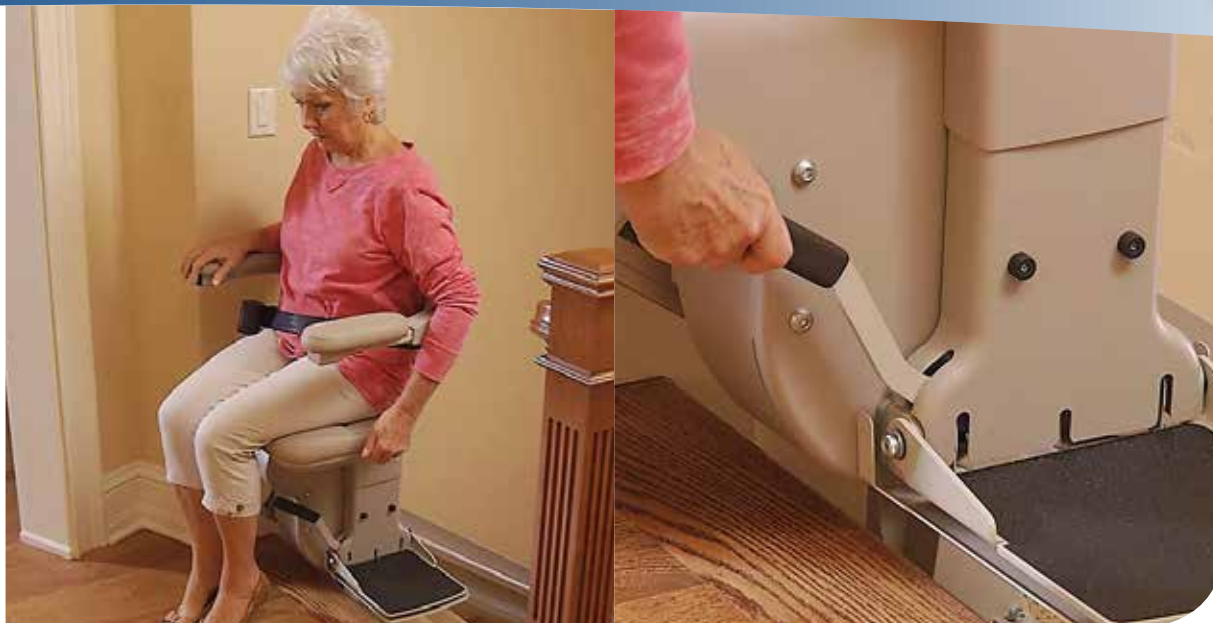
Offset swivel seat makes it easy to get on/off.