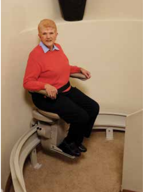
Custom crafted for a precision fit around curves.