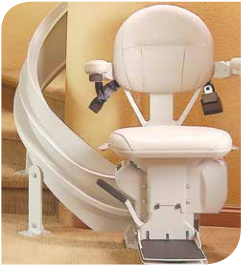
Luxury styling and comfort.

Standard tan vinyl with five optional upholstery selections. Or, supply your own fabric and Bruno will custom upholster the chair for you.