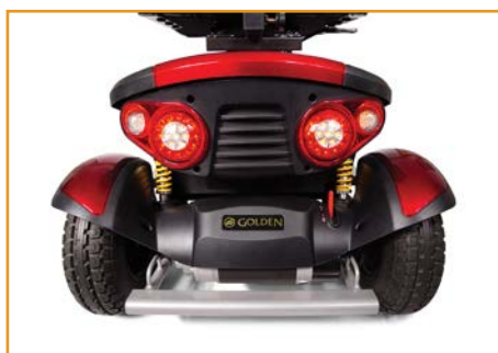
New ultrabright LED rear lights.