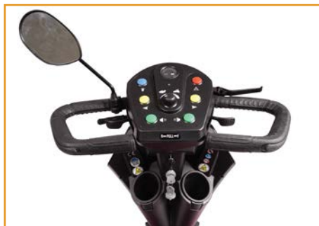
New button covers, hand (parking) brake lock, LED battery meter.