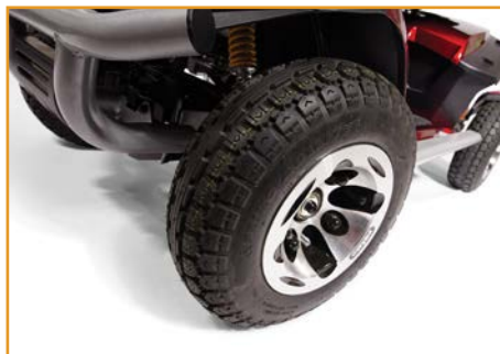
New 13" pneumatic tires.