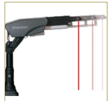
Telescoping version. (VSL 6900)