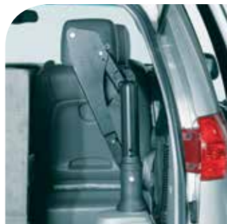
Quick release pin allows lift head to fold down.