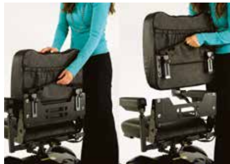
Back-Off easily removes back of mobility device to fit into shorter vehicle openings.