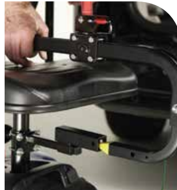
Custom docking devices.