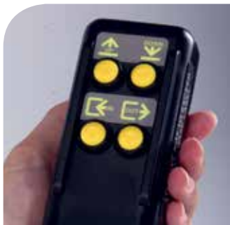
Exterior control pendant. (VSL-6000 only)