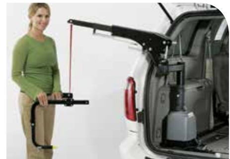
Driver side placement.